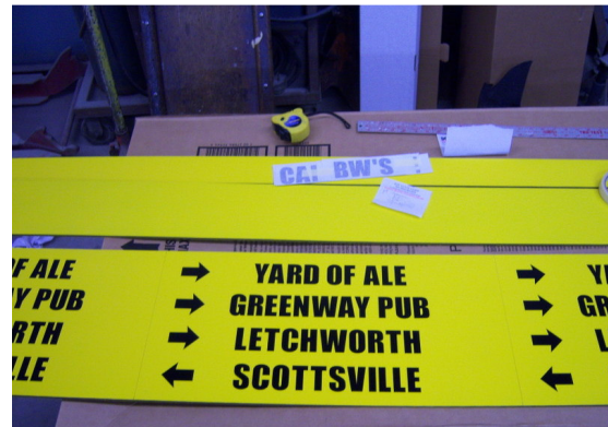
A Big THANK-YOU to Ron Braggs at 7-S Cycle for all he has donated for trail signs